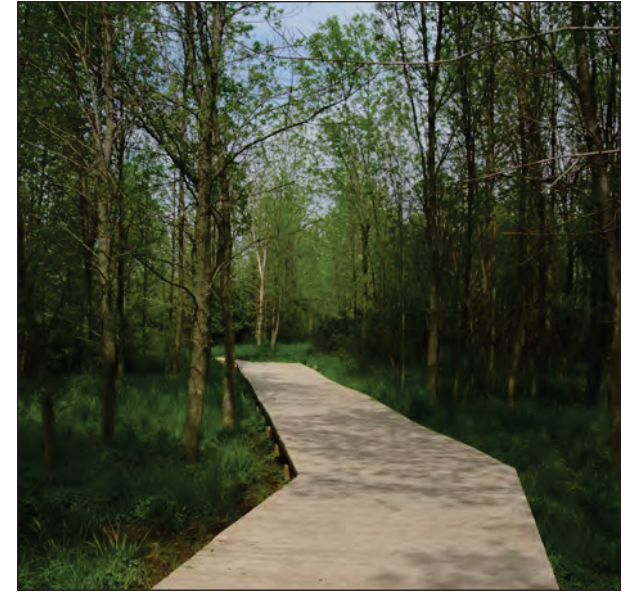
FIGURE 1: A trail system in the Lion's Den Gorge Nature Preserve.

Additional information relating to implementation and a capital improvement schedule can be found in the Town of Grafton Comprehensive Outdoor Recreation Plan.