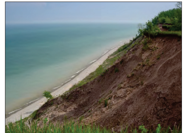
FIGURE 2: A view of a Lake Michigan from the Town of Grafton shoreline.