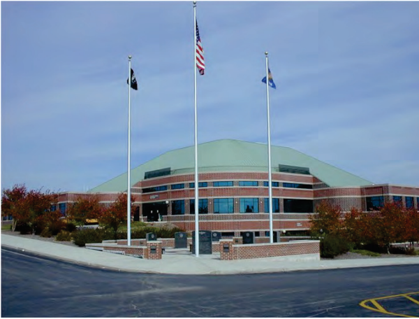
FIGURE 5: Ozaukee County Justice Center.

Lasata Heights, Newcastle Place, and the Sarah Chudnow Campus offer a variety of retirement community services ranging from independent living (with additional personal care services) to assisted living and nursing home facilities.