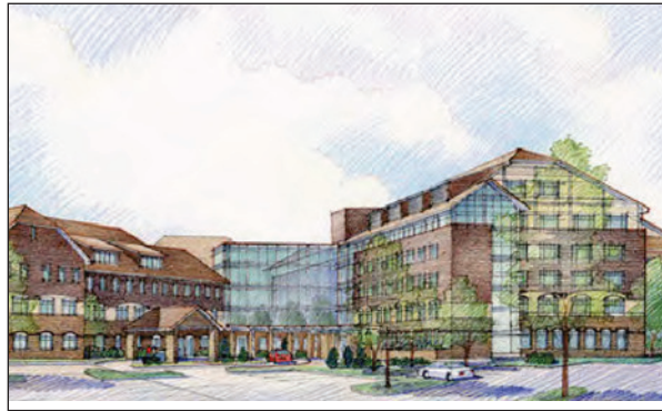
FIGURE 4: Columbia St. Mary's Hospital Ozaukee Campus.

The nearest electric power generation facility to the Town is for WE Energies, and is located in the City of Port Washington.