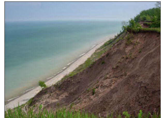
FIGURE 2: A view of a Lake Michigan from the Town of Grafton shoreline.