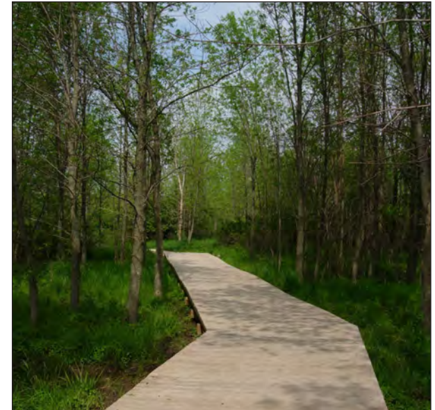
FIGURE 1: A trail system in the Lion's Den Gorge Nature Preserve.

Additional information relating to implementation and a capital improvement schedule can be found in the Town of Grafton Comprehensive Outdoor Recreation Plan.