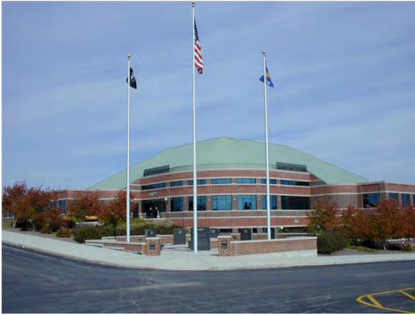
FIGURE 5: Ozaukee County Justice Center.

Lasata Heights, Newcastle Place, and the Sarah Chudnow Campus offer a variety of retirement community services ranging from independent living (with additional personal care services) to assisted living and nursing home facilities.